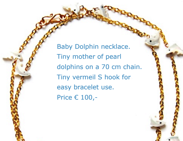
Baby Dolphin necklace. Tiny mother of pearl dolphins on a 70 cm chain. Tiny vermeil S hook for easy bracelet use. Price € 100,-

An extender chain is a common solution to the length dilemma, but better still can be to incorporate flexibility into the design. Like this dainty dolphin necklace with an S-hook - it's long but with S-hook and extra rings it can be shortened to any suitable length.