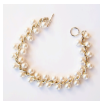
Standard every second bead bracelets

The chains link size in relation to the bead size decides the overall looks of the Coco Chains. In addition the beads can be attached in two different ways. The normal version is with every second link filled. An alternative is to bead on pairs of pearls, which makes it more chunky.