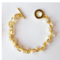
Non standard bracelets. Pearl set deep in very large link.