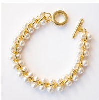
Extra-chunky double beaded bracelets.